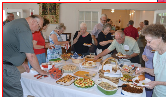
One of Many Monthly Socials