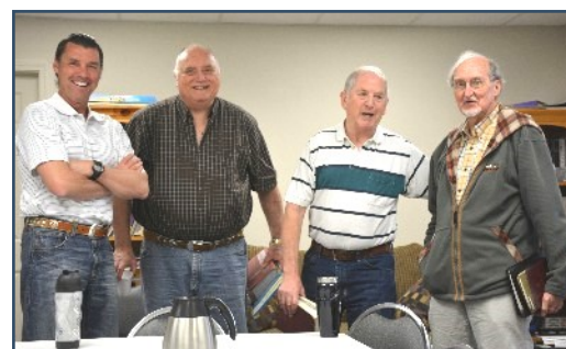
The Tuesday AM Men's Prayer Breakfast Begins