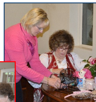
Bingo Night (Feb)