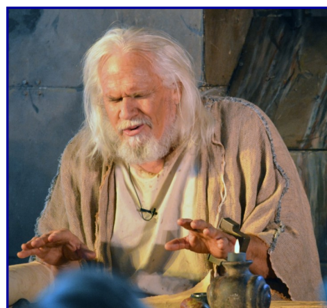
The Apostle Paul Pre- sents Philip- pians (Aug)