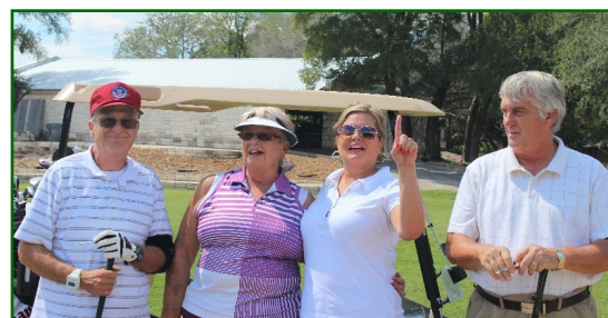
Milton Kattner Golf Scrambles (April & Sept)