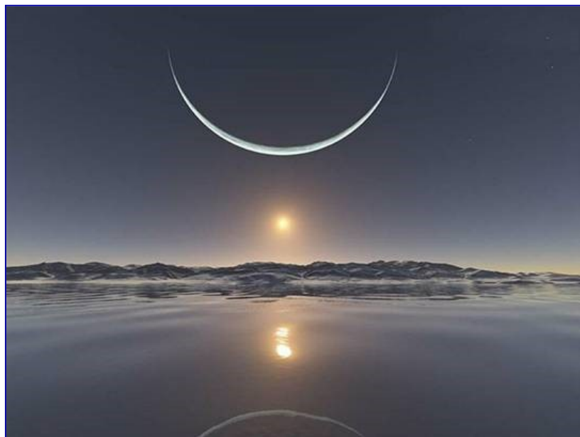
This is the sunset at the North Pole with the moon at its closest point last week. You also see the sun below the moon.