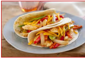
Fajitas, enchilada casseroles and other Mexican dishes.