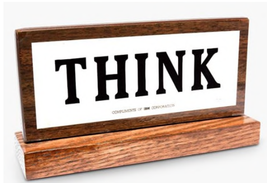
The IBM Corporation THINK - Logo

H--Is it helpful? I--Is it inspiring? N--Is it necessary? K--Is it kind?