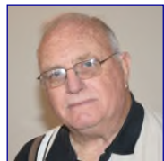
Rip Van Winkle, Worship