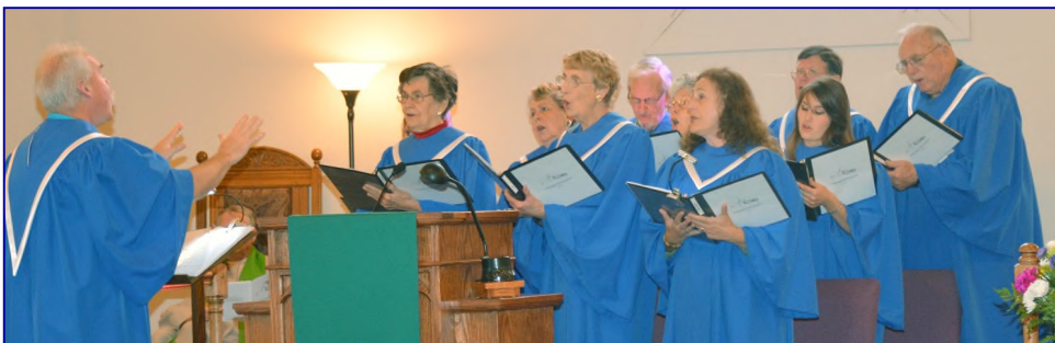
Our Choir is a blessing every week!