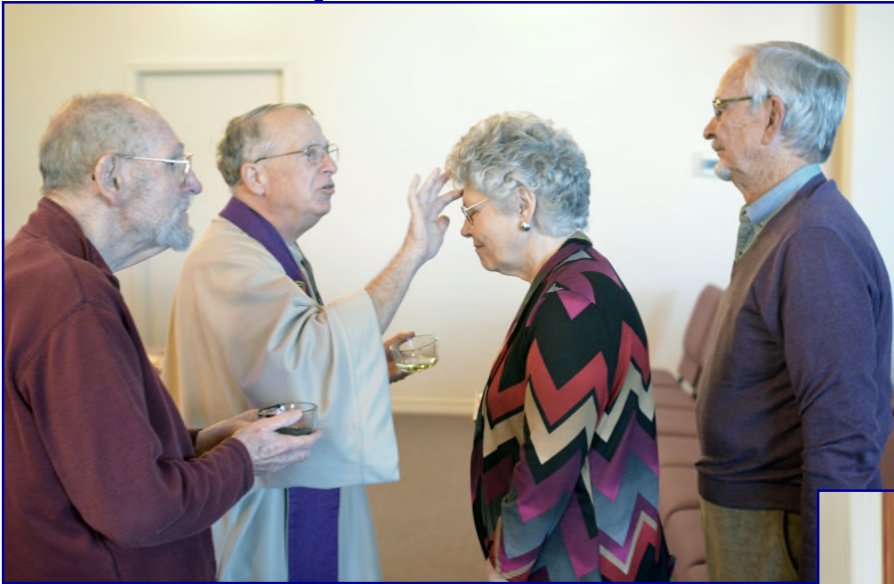
Ash Wednesday 2/10/2016