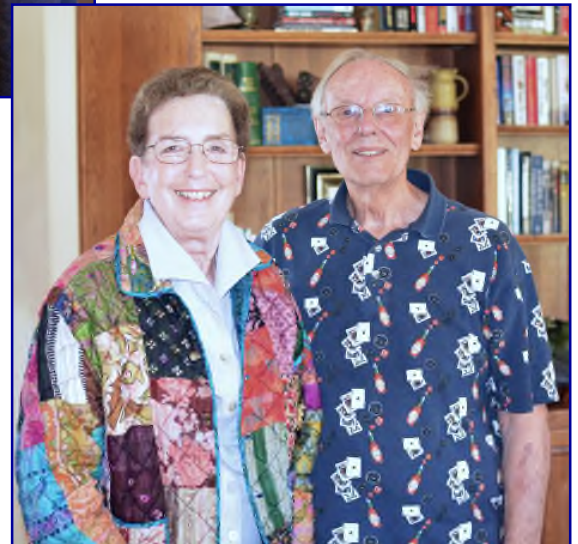
The Walls @ "Going Away Coffee"