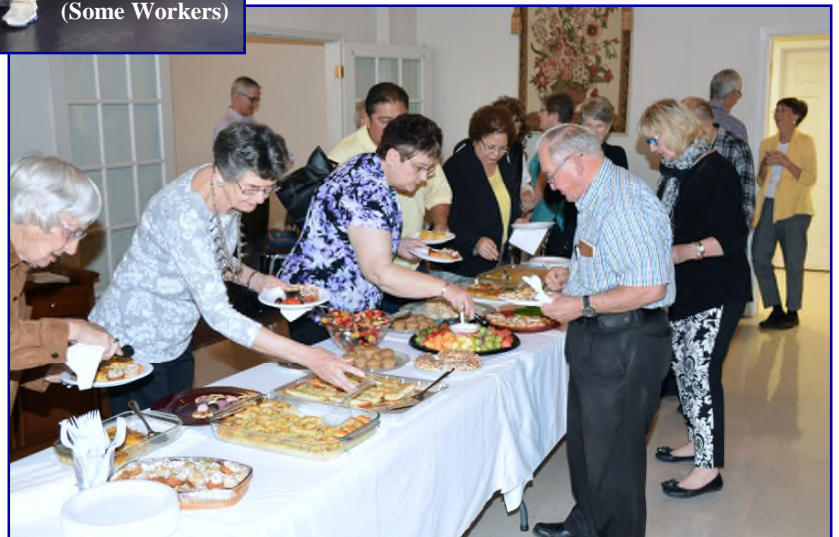
February 28 - Social