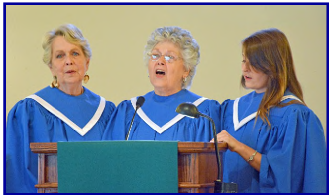
Women’s Trio - “Send the Light”