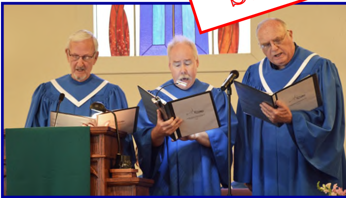
Men’s Trio - “For Those Tears I Died”