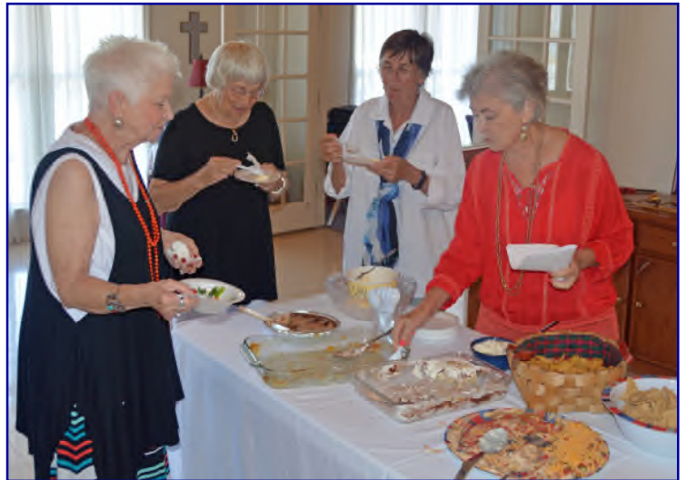
The Women of the Church come through Again!