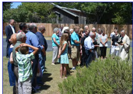
Jones Family Children (6 of 7)