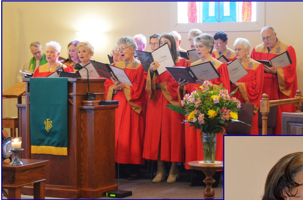
Presbyterian Church Choir "Blest Are They"