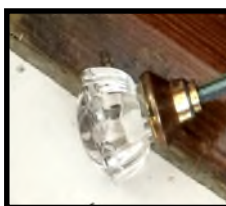
Flying Door Knob

Benevolences were 26.3% of total giving in 2016!