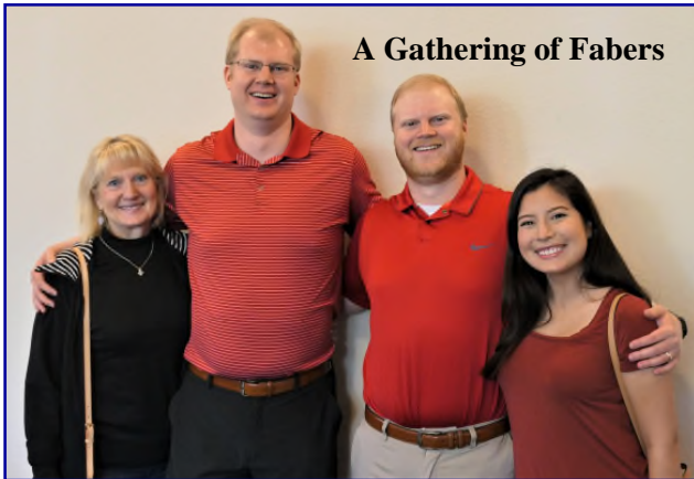
A Gathering of Fabers