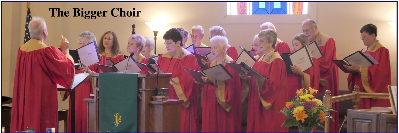
The Bigger Choir