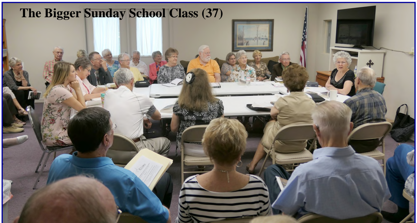
The Bigger Sunday School Class (37)