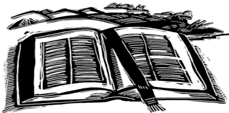
Men's Bible Study