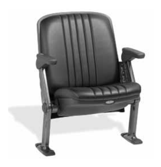
Chairs come in eleven standard widths: 19", 20", 21", 22", 23" & 24" 500 mm, 525 mm, 550 mm, 575 mm & 600 mm