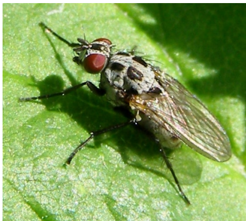
Fig. 1. Anthomyia plurinotata female.

On 13 September 2014 I caught a male (Fig. 2) at SU742716, on a beech log in a clearing in the Wilderness, an area of old woodland that runs along the south-east boundary of Whiteknights Park. The absence of previous British records of such a distinctive species suggests that it may be a recent arrival in this country.