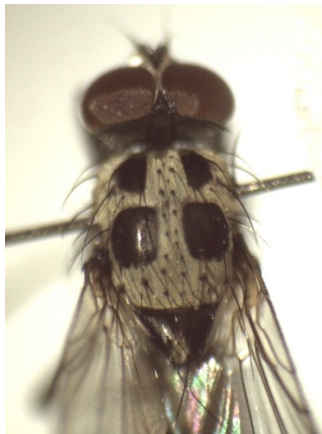
Fig. 2. Anthomyia plurinotata male.

According to Michael Ackland ( pers. comm. ), there are no other Anthomyia species in Europe that have only two postsutural black spots or marks on the thorax; the other four black and white British species have three such spots including a central one. The male genitalia (Fig. 3, 1-8, drawn by Michael Ackland) have a characteristic profile to the fifth sternite, which have a small membranous area.