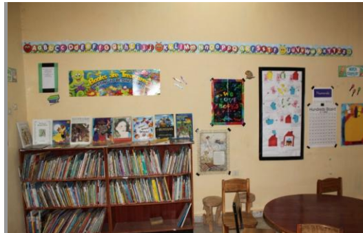
Children's Room in the Library