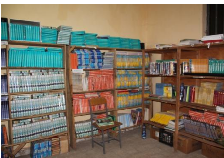
Storage with textbooks in many classrooms

These books need to be catalogued in a computer to provide information to interested readers and for the purpose of lending books and recording. Each book must be entered into the computer most be done by hand and is very time consuming. This year numerous eager volunteers have come to lend a hand. The fine job they did is helping to empower the people of Hosanna.