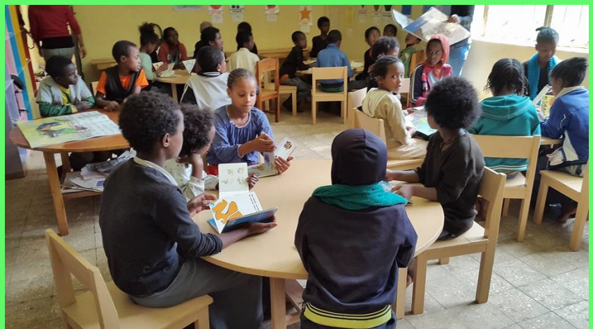
Kindergarten children in the library