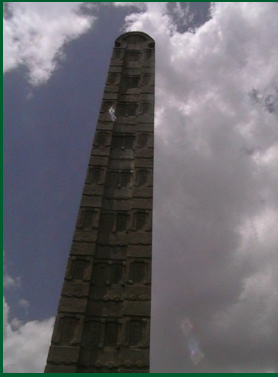
Obelisks of Axum, the oldest dating from 5000-2000 BCE