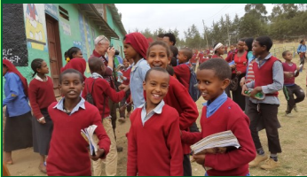
School children in Hosanna