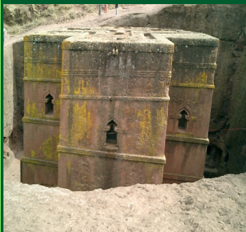
Lalibella, Tte UNESCO World Heritage Site of 12th century churches carved into the stone mountain