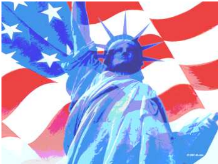
Our Lady of Refuge, Pray for us!

Not like the brazen giant Greek of fame, with conquering limbs astride no land to land; here at our sea-washed, sunset gates shall stand a mighty woman with a torch, whose flame is the imprisoned lightning, and her name Mother of Exile. From her beacon hand glows world-wide welcome; her mild eyes command the air bridged harbor that twin cities frame. "Keep, ancient lands, your storied pomp!" cries she with silent lips. "Give me your tired, your poor, your huddled masses yearning to breathe free, the wretched refuse of your teeming shore, send these, the homeless, tempest-tost to me. I lift my lamp beside the golden door!" (Emma Lazarus, 1883)