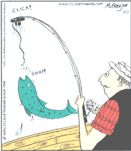
To help fishermen substantiate the one that got away, Nikon introduces its new Fish-Cam 2000.