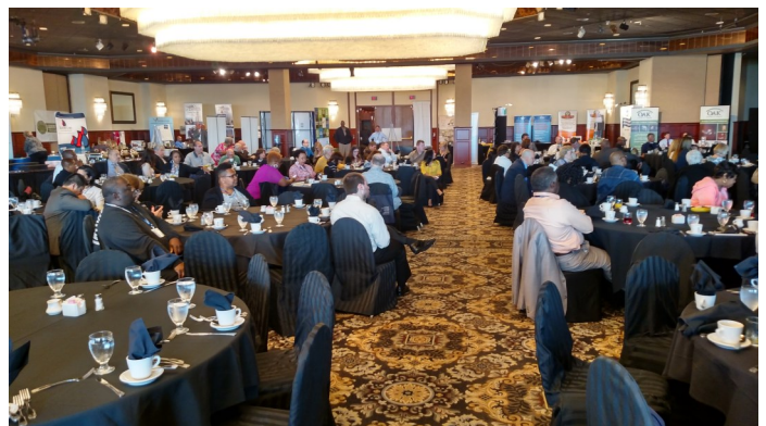
Attendees enjoy their luncheon at the Joint NJNAHRO/MARC NAHRO conference held in April.