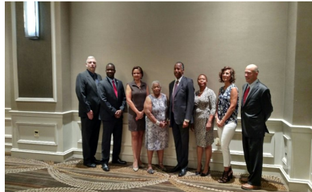
HUD Secretary, Dr. Ben Carson, meets MARC NAHRO members at their annual conference in Washington, DC.