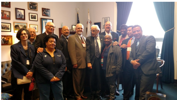
New Jersey NAHRO members meet with long-time friend and affordable housing advocate, Congressman William (Bill) Pascrell.