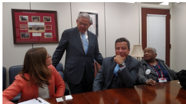
Senator Robert (Bob) Menendez met with our members during the NAHRO Legislative conference in Washington, DC