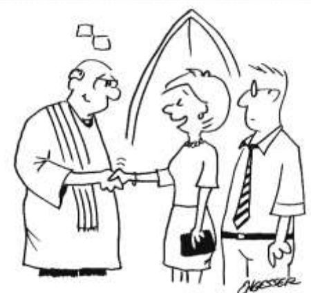
"The heart-shaped communion wafers were a nice touch for Valentine's Day."