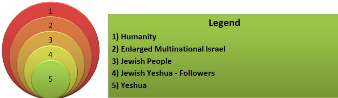
Expanded Bilateral Model

This model though shares a similar weakness with the others, which is even more apparent in this diagram. Each of these circles in the Venn lines up like a perfect array of the planets. Whenever I shop at the supermarket down the street from my home I am afforded the opportunity to play an electronic “slot machine” at the checkout. If I get three “Big Y’s” in a row I win and receive my groceries for free, an event that has not yet occurred. As a necessary precaution I continue to bring my wallet with me to the supermarket. It is not that I don’t hope to win or believe in the inevitability that I will win, but the present situation demands that I am prepared to pay the price necessary to eventually arrive at that day. This model has as high an eschatological focus as the other two and the alignment of the sets makes it even more apparent. This is more than an ideal; rather I believe this represents a reality that is greater than our present reality. The unseen presence and mediation of Yeshua from within Israel is not a distant future, nor is the actualized presence of Yeshua through the Jewish people in the midst of the enlarged multinational Israel, nor is the felt presence of Yeshua in the world through the Church. But the full recognition of these realities requires an “evangelical imagination” a term coined by Walter Bruggemann. By evangelical he is not referring to any contemporary religious movement or