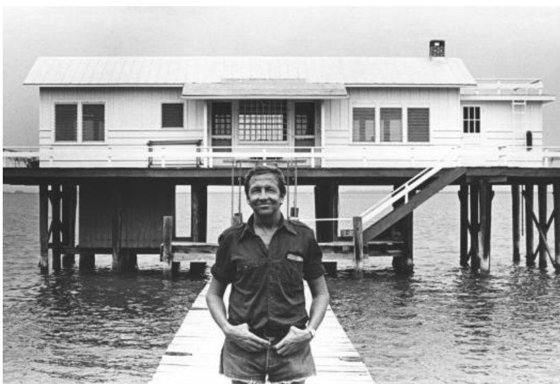
Robert Rauschenberg in front of the Fish House, 1979.

I will miss the residency so much but I'll be so happy to be back at P.S. 11 with all my friends!