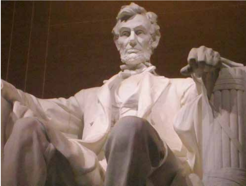
BY SADIE HOWARD