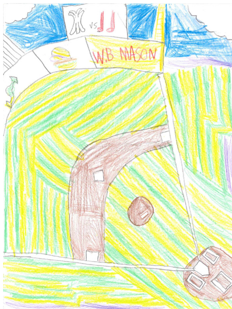
ILLUSTRATION BY DAVID BERKEBILE

ries again in 2007, 2013, and THIS year in 2018!