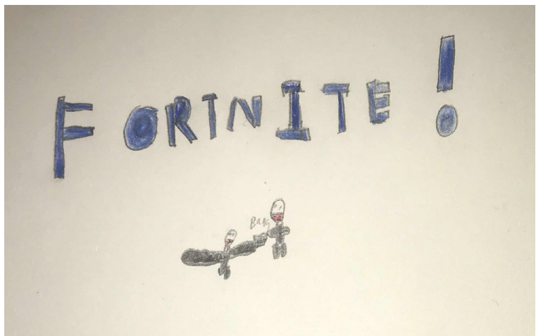
ILLUSTRATION BY TEDDY KENNELL

brains about video games is that they are fun. This is important because people will play video games so that they are not bored, which means that people play video games a lot.