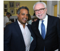
Manu Raju and Wolf Blitzer.