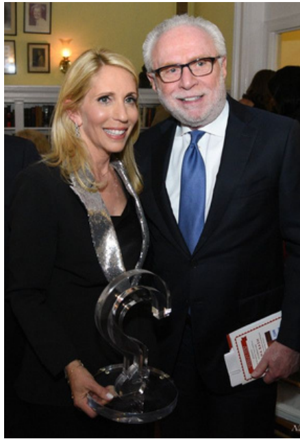
Dana Bash , ANWC Excellence in Journalism (ANWC-EIJ) recipient 2023, stands alongside Wolf Blitzer , (ANWC-EIJ) recipient 2019 and anchor of the CNN's the "Situation Room".