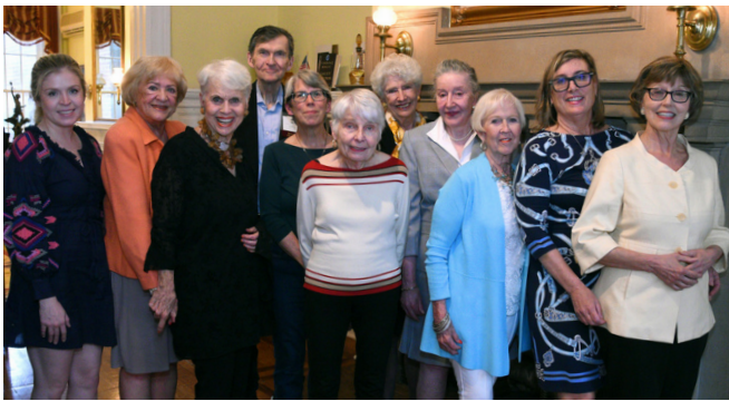
The definition of a "small but mighty" crew that keeps things going at the ANWC.