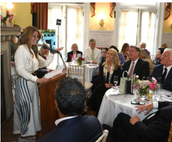
Nicole Wallace delivers a heartfelt toast/roast to Dana Bash.