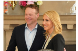
Chris Licht and Dana Bash.