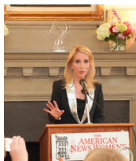
Dana Bash, takes the podium to express her gratitude to the ANWC.