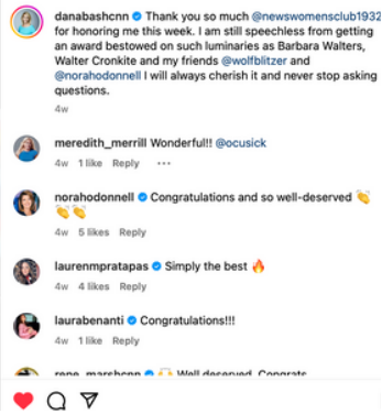
Dana Bash writes thoughtful Instagram post thanking the ANWC.