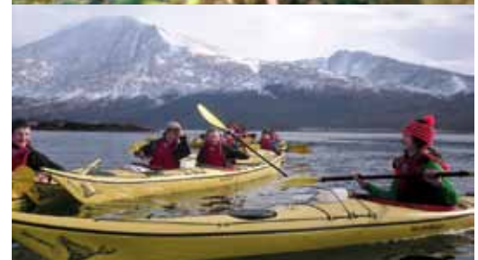
People and wildlife thrive in wild places

protected by any form of national or international designation, and only around a third receives protection from a specific landscape designation, such as a National Park or a National Scenic Area (NSA). As a result, much of this wild land is being lost or degraded at a rapid rate. This is why the Trust is calling for better protection for a larger area of wild land across its entirety in order to maintain the integrity of the wild land resource. ■