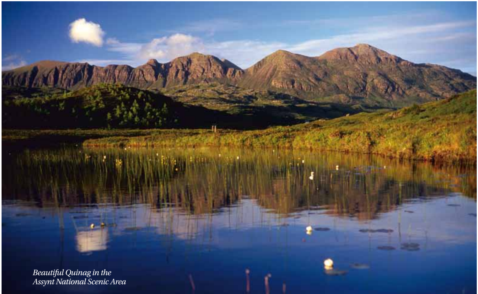
Beautiful Quinag in the Assynt National Scenic Area