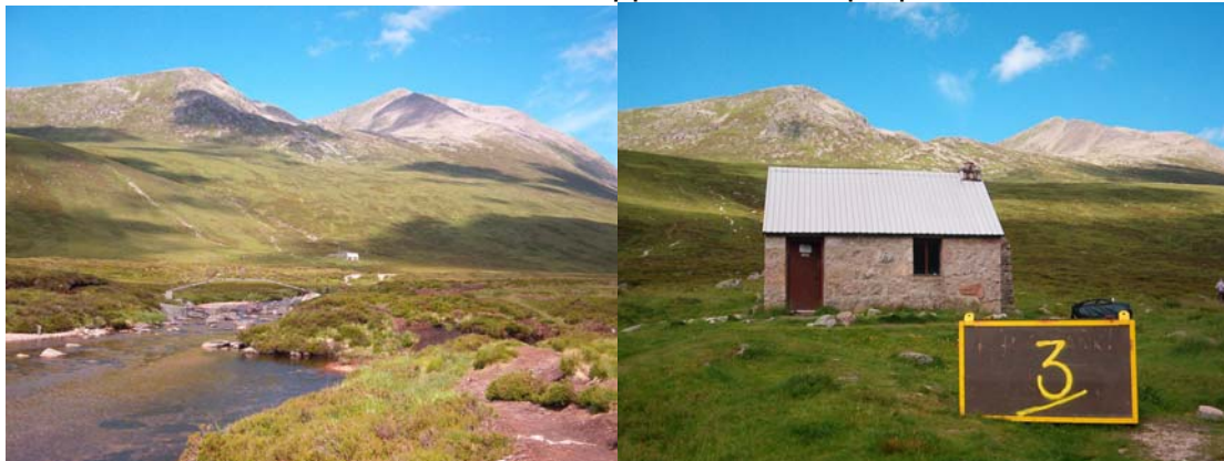
Figs 1 & 2 Distant and close up view of Corrour Bothy with Cairn Toul in background