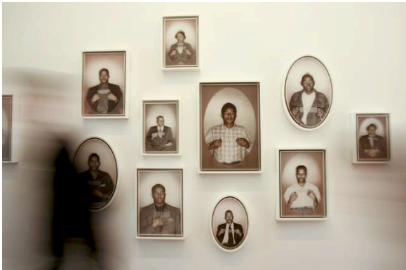
These oil paintings are based on police booking photos of civil rights activists that were found on file in Montgomery, Ala. The photos were taken during the Montgomery Bus Boycott in 1955-1956.