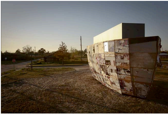
Mithra, a three-story ark by Mark Bradford in the Lower Ninth Ward, was built using detritus gathered from the district, which was among the most devastated by Katrina.