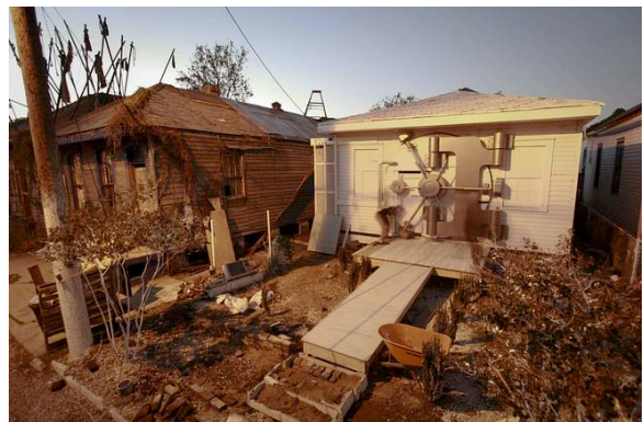
Mel Chin's "Safe House" at KKprojects is one of several unofficial exhibitions taking place during the New Orleans Biennial.