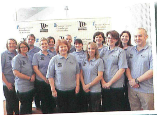
← The Prostate Cancer Specialist Nursing Service team launch in Melbourne

My ultimate goal is to see men feeling better, whatever they are facing."