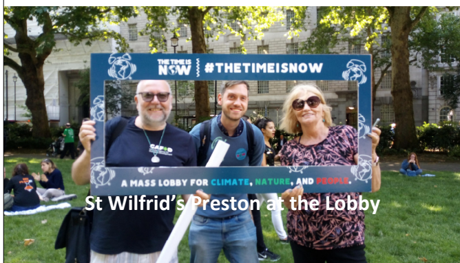
St Wilfrid's Preston at the Lobby

Having achieved our aim for that day, we wandered back to Euston after a picnic lunch, on a glorious day passing through St. James's Park, by Buckingham Palace, through Green Park, and once more onto the tube.