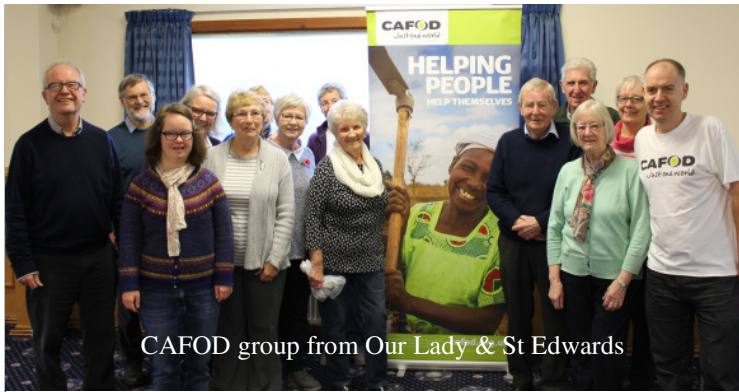
CAFOD group from Our Lady & St Edwards