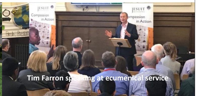
Tim Farron speaking at ecumenical service