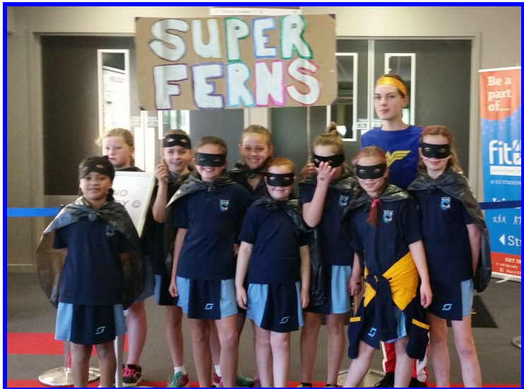
And here they are...oh, they're in disguise...hang on - we'll get a better shot...