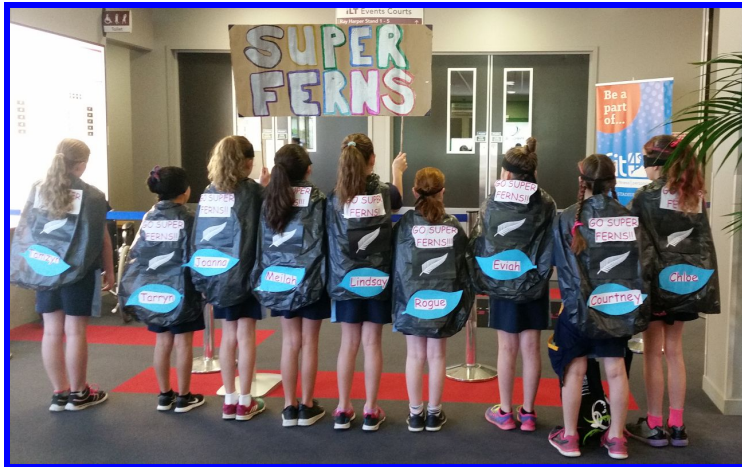
Ah, that's bett...sigh. Nevertheless: Winners of the Best Dressed Team Award!