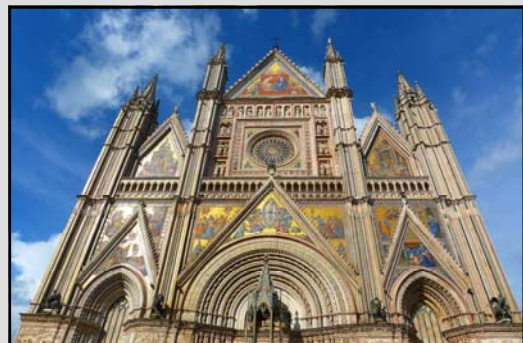
Duomo di Orvieto

- from Eucharistic Miracles (Charlotte, NC: TAN Books and Publishers, Inc., 1987). ■