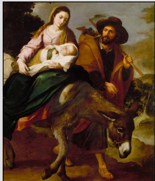
The Flight into Egypt (detail) by Bartolomé Esteban Murillo

- from St. John Paul II, Familiaris Consortio (Libreria Editrice Vaticana, Nov. 22, 1981), §52. ■