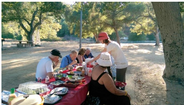
Dig in! Everyone brought super yummi food to share!.