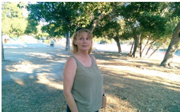
Uh... which camera should I look at?