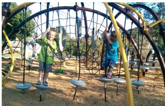
Trouncing around on the playground!