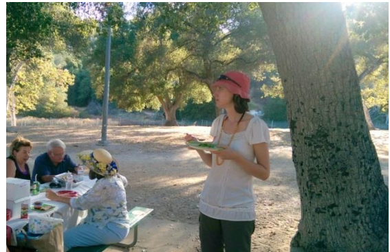
It's safer over here under the trees... at least from the bees!