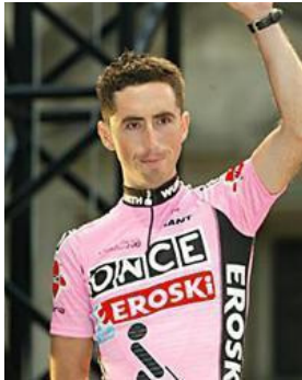
Joseba Beloki

Spanish cycling star Joseba Beloki has found a team for 2004, and will announce it on Thursday, November 13, European time, according to a report in AS. The team will not be a Spanish squad, and Saeco, Gerolsteiner and Lampre have been named as the strongest candidates. Beloki recently called off a deal with potential new cycling team Stayer, after it didn't pay its bank guarantee in time and couldn't assure participation in the 2004 Tour de France.