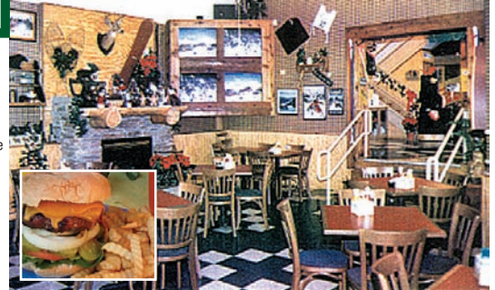
Map Location 17