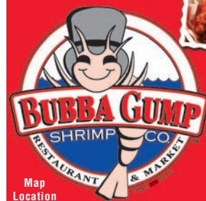
Map Location 61