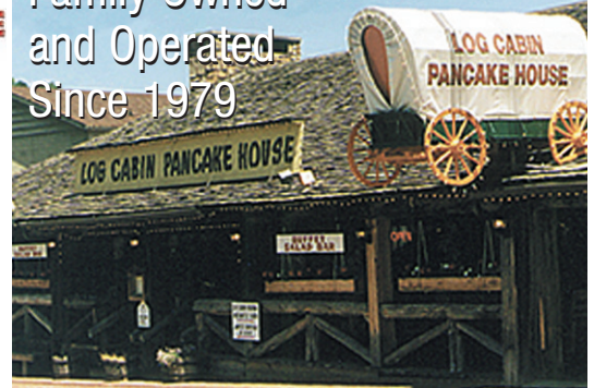
Map Location 67