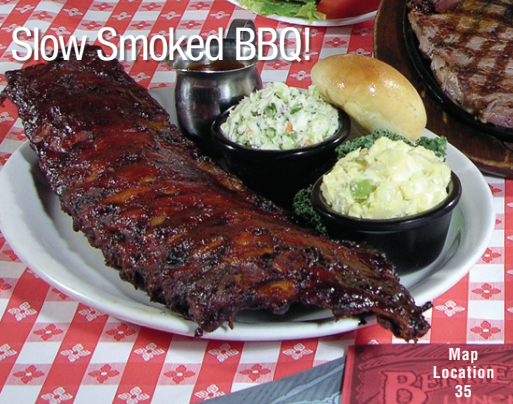
Map Location 35