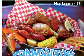
Map Location 77

900 Parkway, Traffic Light #8 Gatlinburg, TN 37738 • 865/430-3034