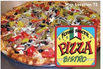
Map Location 72

crawdaddysgatlinburg.com 762 Parkway #5 Gatlinburg, TN 37738