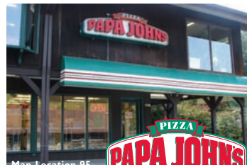
Map Location 95

631 Parkway, Suite B-4 Gatlinburg, TN 37738 • 865/436-0013