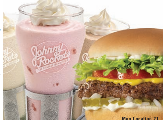
Map Location 21