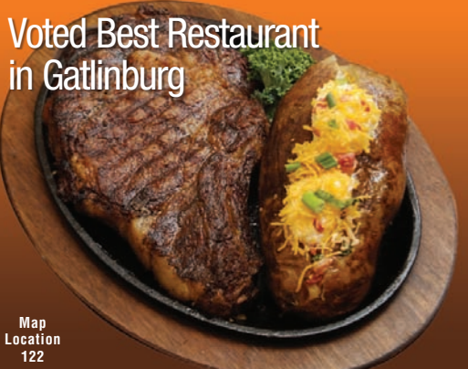
Map Location 122