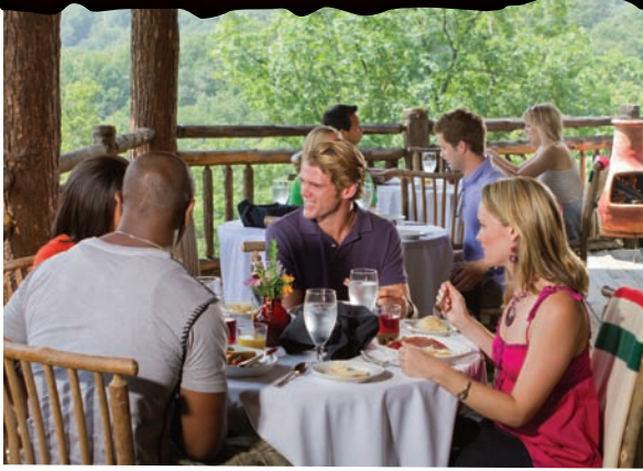
Over 100 places to eat.