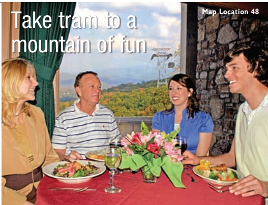
Map Location 48