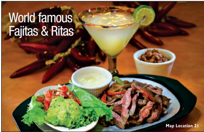
Map Location 21