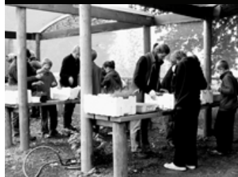
'Pricking out' seedlings at a recent family day

You may have noticed the fresh mulch and proliferation of new plants at Wesley Park. It's all part of a low maintenance, 'waterwise' display garden conceived and created by the Newham Garden Club and local Landcare group.