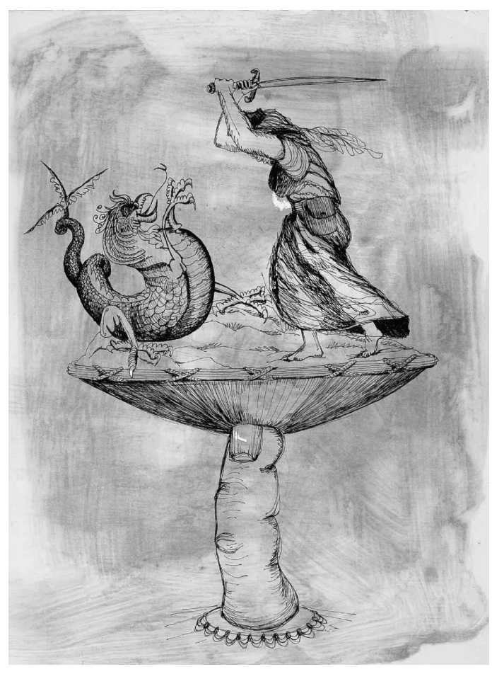
Figure 2. Bill Wynne, Presentation Drawing for Salvador Dalí's Proposed Monument to Captain Sally Tompkins , 1966, ink on paper.

Avenue's Confederate memorial theme with seven additional statues.