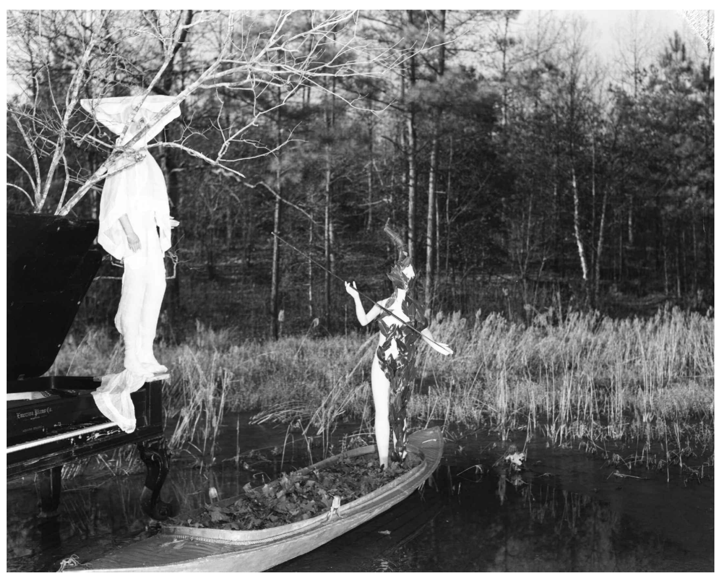
Figure 6. Dalí's Enchanted Garden at Hampton Manor, 1941.

scheme. According to Moore, Dalíland was the elder Reynolds's idea, offered up over cocktails at the St. Regis Hotel in New York where both Dalí and Reynolds were staying.<sup>14</sup>