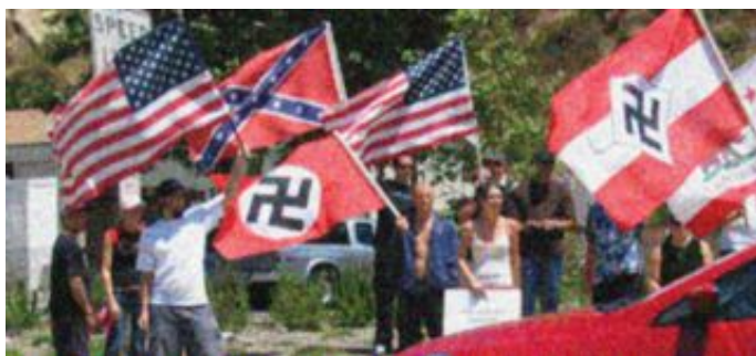
Whatever their cause, these protestors are using flags as a means to confront others. The CSA flag in the background is tarnished by association with any hate group.

Unfortunately, several hate groups have co-opted the Confederate Battle Flag for disgraceful and unseemly purposes. The SCV abhors these actions as well as these organizations. The SCV neither embraces, nor espouses acts or ideologies of racial and religious bigotry, and further, condemns the misuse of its symbols and flags in the conduct of same. It is a strictly patriotic, historical, educational, fraternal, benevolent, non-political, non-