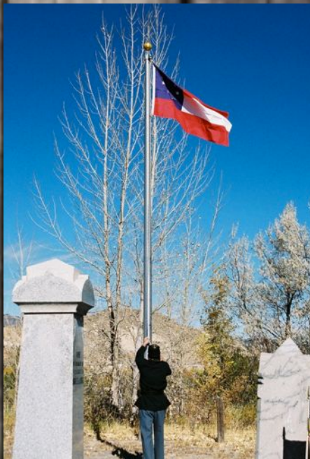
Stars 'n Bars raised at the Confederate Memorial in Evergreen Cemetery, Cañon City