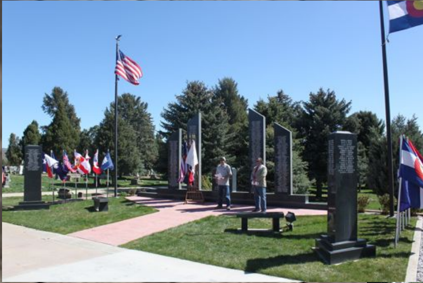
Confederate Memorial Day opening remarks at the Cedar Hill Veterans Memorial