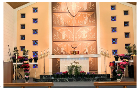
Our Sanctuary with the Easter plants